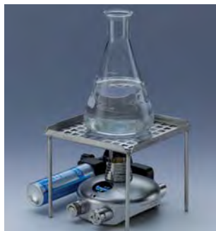
Hot-Tray with schuett phoenix II and CV 360-adaptor/cartridge for operation in chemical lab (height-optimized)