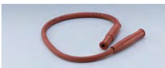
Gas-safety hose for natural gas, slip-on (DVGW-certified)

If the flame stops due to e.g. spilled liquids and the burner may not be re-ignited, the gas supply is automatically and permanently shut.