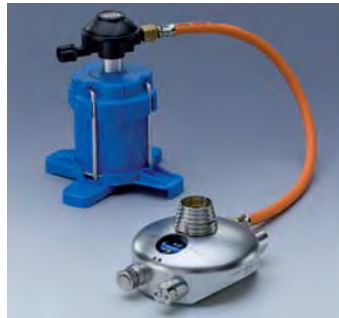
schuett phoenix II with C 206-adapter incl. pressure reducer and gas-safety hose as well as cartridge

Optional to operate with central gas supply (natural gas) or with gas cartridges (propane/butane)