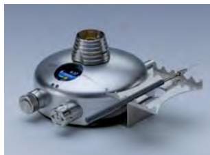
Instrument tray with inoculating loop holder, rotatable for optimum workplace convenience