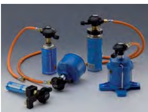
Choice of gas cartridges with adapters, partially including pressure reducer and gas-safety hose.