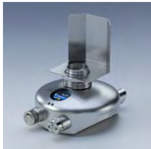
schuett phoenix II with flame shield