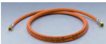
Gas-safety hose for propane/butane, screwed (DVGW-certified)

Sources of energy? You need it - we have it