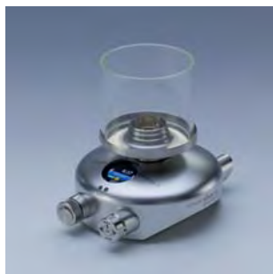
schuett phoenix II with glass spatter guard