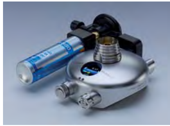
schuett phoenix II with CV 360-adapter incl. pressure reducer and cartridge

Sources of energy? You need it - we have it